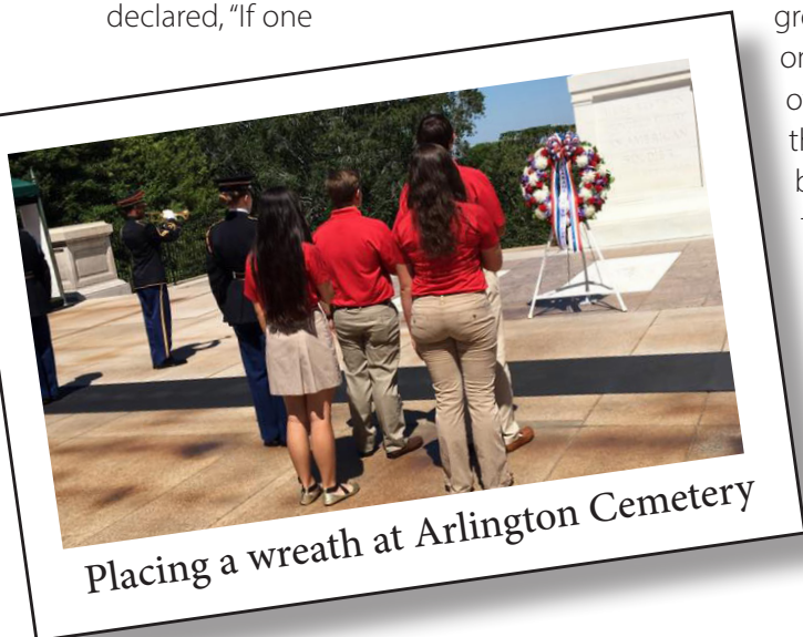
Placing a wreath at Arlington Cemetery