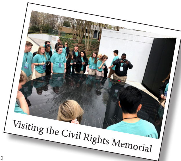
Visiting the Civil Rights Memorial

In 1958, rural electric cooperatives in Iowa sponsored the first group of 34 young people on a week-long study tour of the nation's capital. Later that same year, another busload of students went to Washington, D.C., from Illinois. The idea grew, and other states sent busloads of young people throughout the summer. By 1959, the Youth Tour had grown to 130 students.