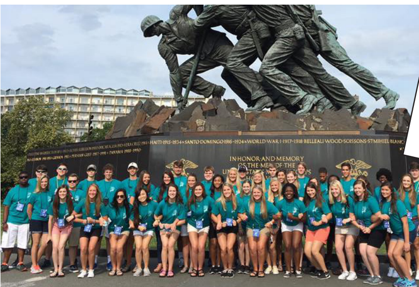
At the Marines Memorial in Washington, D.C.