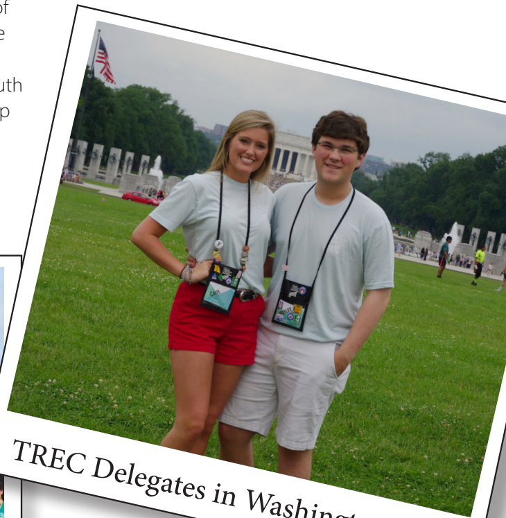
TREC Delegates in Washington, D.C.